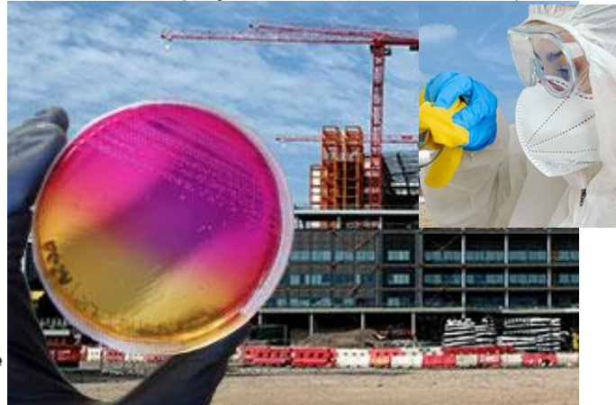
Photo credit to EMSL Microbiology Laboratories, October 2022. Beyond Code Minimum – Aspergillus Nosocomial Culture & Vancomycin Resistant Bacteria.